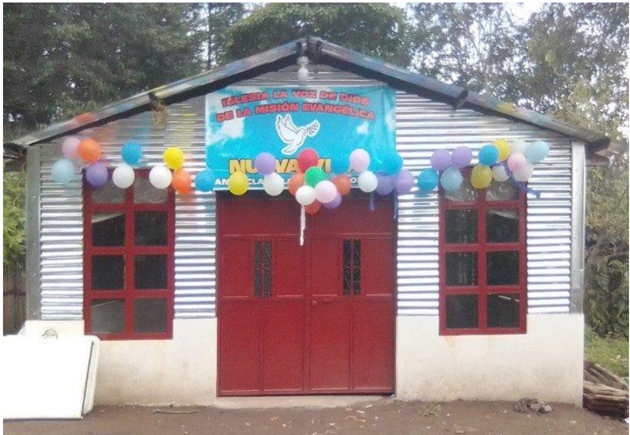
Santa Clara Church Dedication -- Sunday, September 13, 2021

Keep in mind, interns must be 18 or older and there is an application process. If you'd like to learn more about our internship program, please don't hesitate to reach out to Becca at rebecca@impactoministry.com .