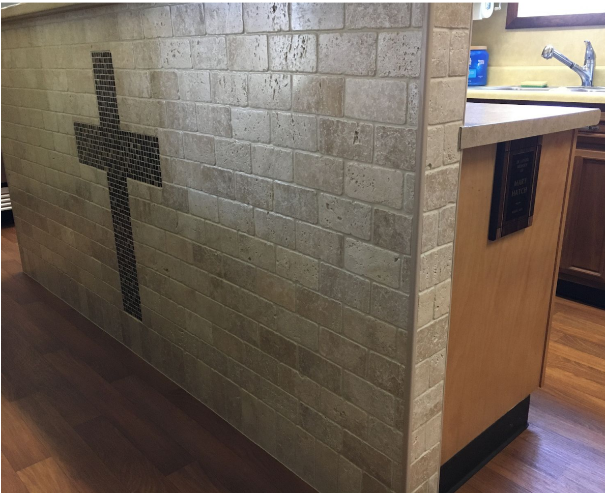
Beautiful inlaid cross on kitchen Island, by Ron Kile.