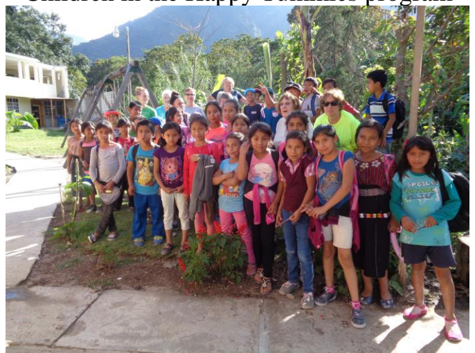
Children in the Happy Tummies program