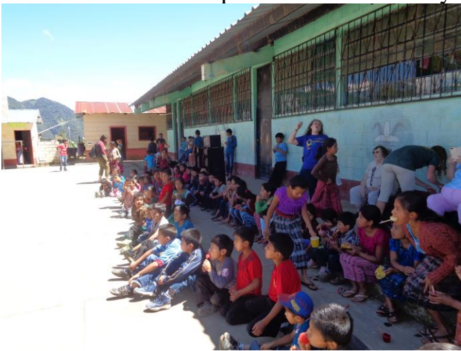
Visited a school and presented a bible story.