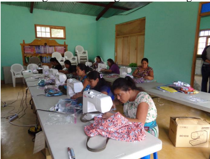
sewing ladies working on the tote bags