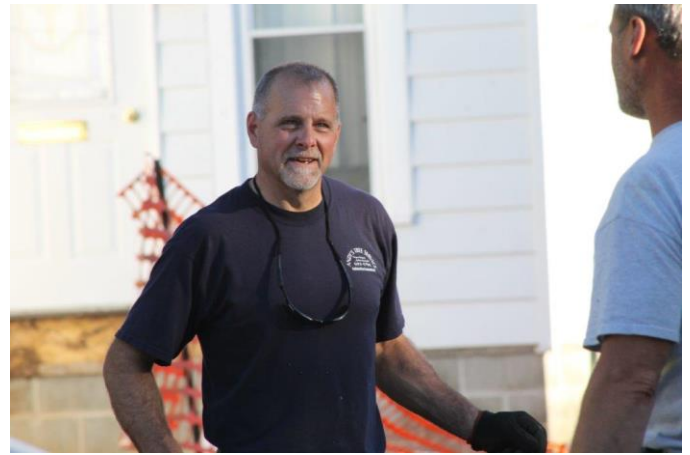
Replacing the Basement/Bilco Doors