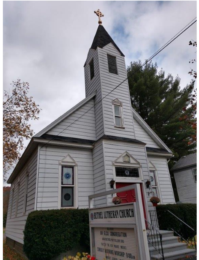
The Beauty of Bethel