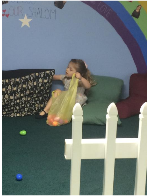
We have a group of very serious egg finders!!!!