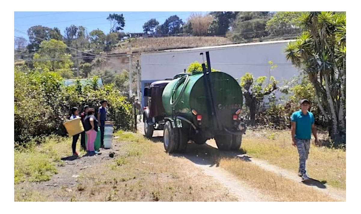
Pictured above is a "water cistern."

Wow! Wow! We are completely blown away at how many of you God is using to answer our prayers! He is so Good! We have enough funds so far to help about 400 families! Thank you for your gifts and compassion. As mentioned in our previous e-letter, you will be helping families from different parts of the country. We are getting organized and praying for the best way to deliver the food. Since the people being helped are in different areas we need to know the laws, rules, and regulations for each area so that our actions to help don't turn into a chaotic mess.