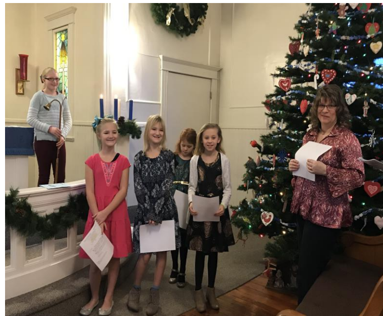
Lighting the advent candle– Sunday school girls.