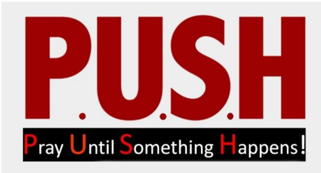
Sent by Tinette